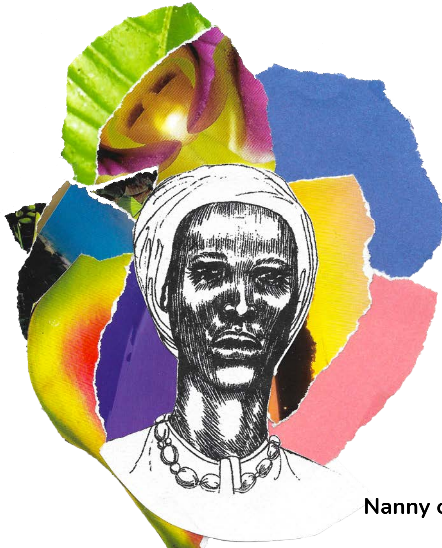
Nanny of the Maroons

(1) BUILDING SOLIDARITIES AND COMMUNITY WITH BLACK WOMEN AND GENDER EXPANSIVE PEOPLE FROM AND IN THE CARIBBEAN AND IN LATIN AMERICA.