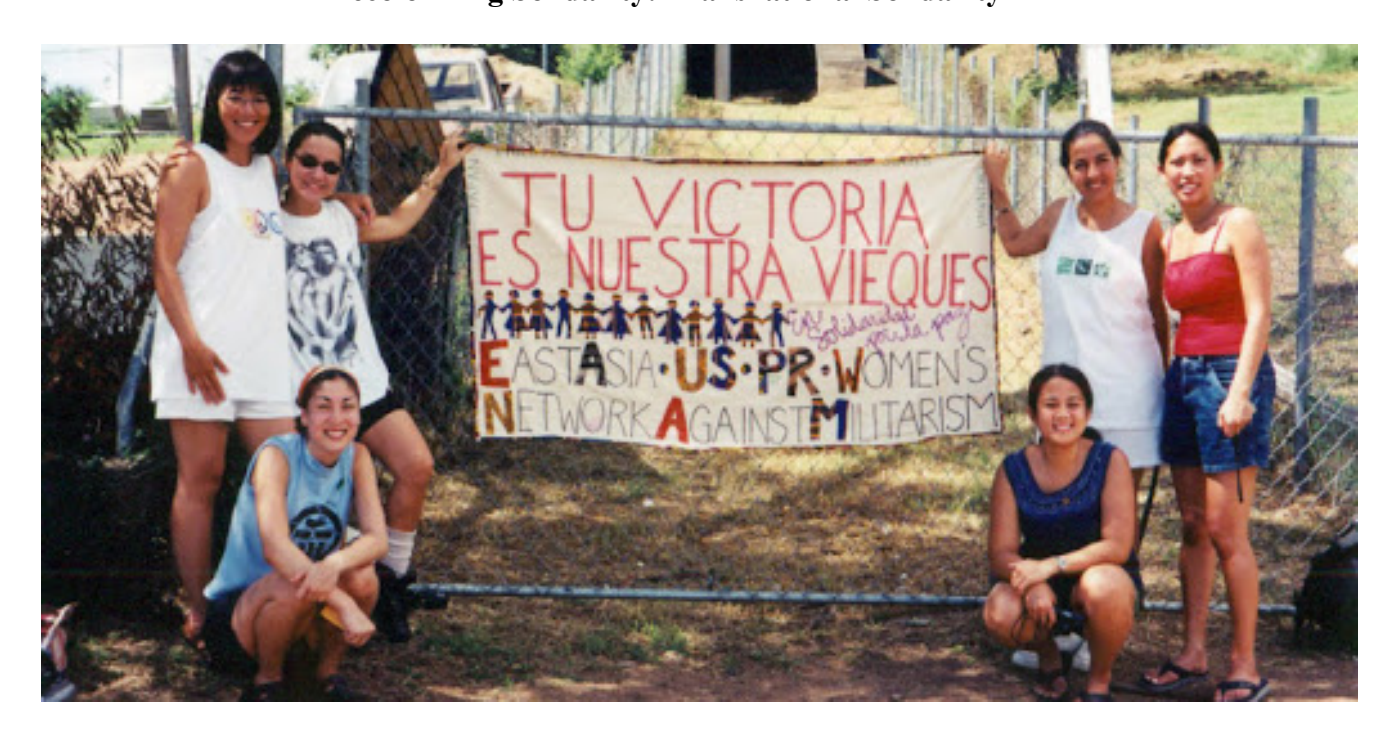
Image 6: International Women's Network Against Militarism, East Asia US Puerto Rico Women's Network Against Militarism, http://iwnam.org/.

The bright red handwritten words "Tu Victoria Es Nuestra Vieques" stand out in the above image, a photograph taken by the International Women's Network Against Militarism, known as East Asia U.S. Puerto Rico Women's Network Against Militarism at the time, as they